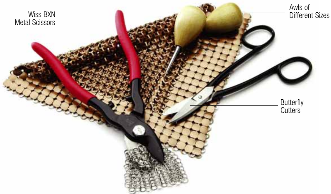
Wiss BXN Metal Scissors